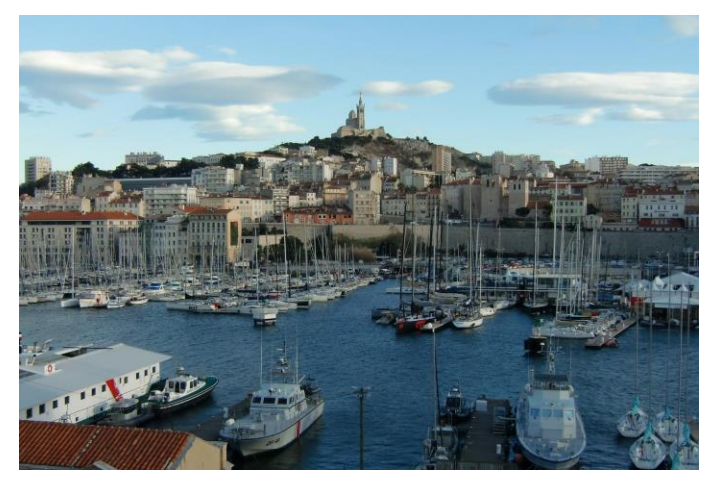
Fig. 1. The Old Port of Marseille (French: Vieux-Port).

During my stay, firstly we discussed methods currently used to measure surface tension using acoustic levitation, exchanged recent results and identified unique aspects of our research. Further part of my stay was devoted to the work with experimental setup and optical devices. An overview picture of the experimental setup is shown in Fig. 2(a). During the training I learned how to adjust the illumination light sources, maintain detectors and CCD cameras and how to use the rainbow angle diffractometry for sizing evaporating droplet. I was also acquainted with sample preparation and operation of the acoustic